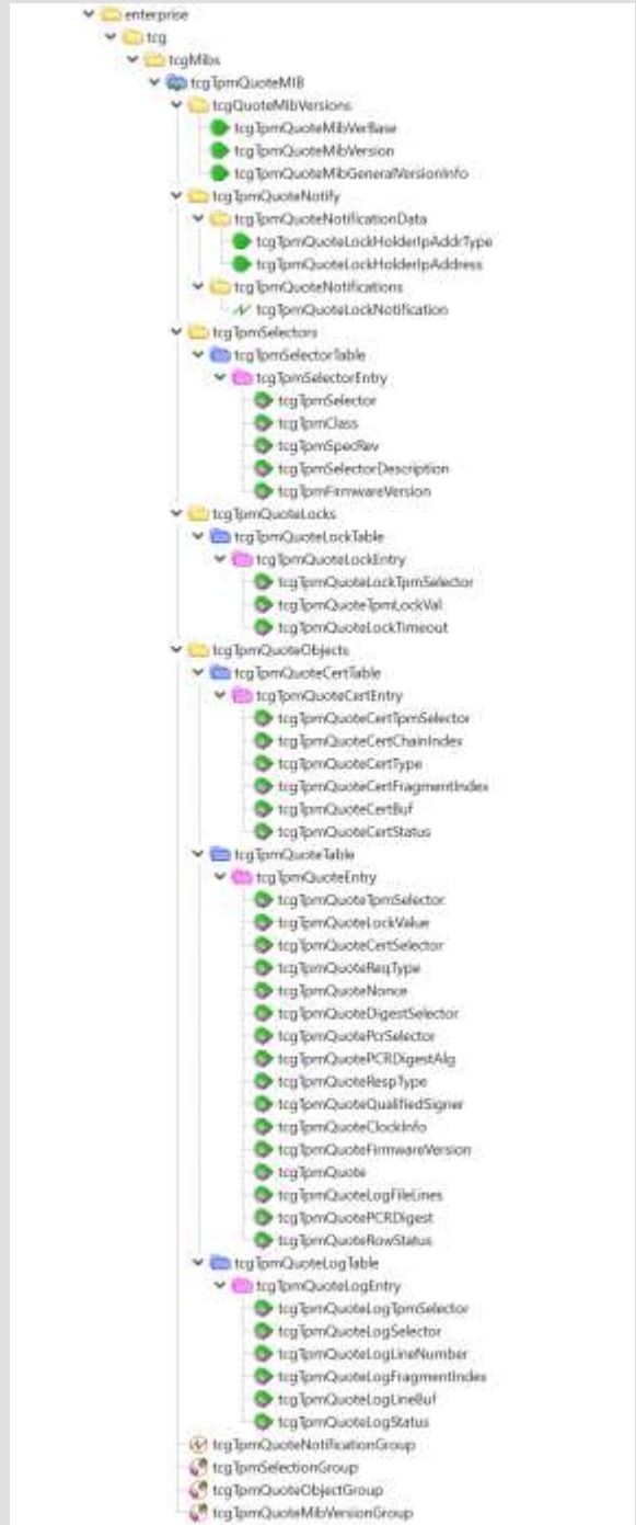
Figure 1 - MIB Tree

The MIB tree diagram shown in Figure 1 provides a graphical overview of the MIB.